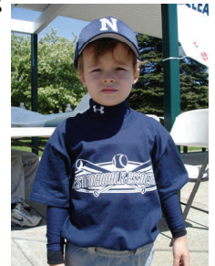
Team WNA !!!